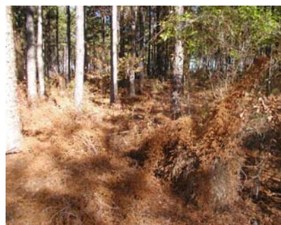
60 days after treatment using a private contractor

This private property site is surrounded on three sides by the Apalachee WMA. While the property is mostly in peanut and hay production, there is an 80 acre Slash Pine stand on the southern boundary with a wide-spread Lygodium japonicum infestation. ARSA CISMA hired a private contractor to spray the site as well as approximately 5 acres of infested Chinese Tallow on the property.