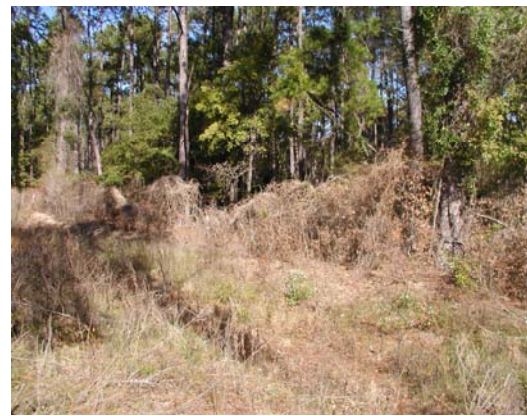
60 days after treatment using a private contractor.

The property owner is the third generation in Jackson Co family farmer who grows peanuts, hay and cotton on the boundary of conservation lands, in this case Three-Rivers State Park. This project was an opportunity to show our professional abilities on the fenceline immediately separating his property from DEP’s park property. The homeowner reported his satisfaction with the project and has invited us back to continue treatment in the most infested areas...the hills above his fields. Park staff have also identified these hill tops as the source of major infestations in the park after rain events.