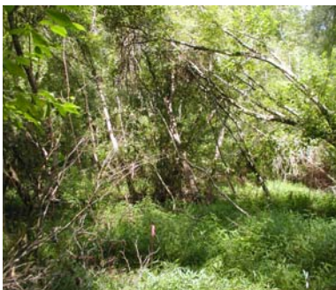
Point 2 of 5 before treatment