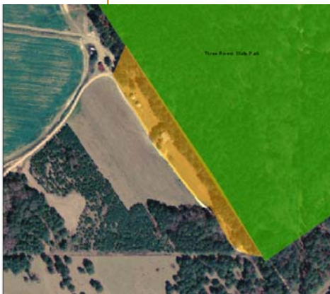
Fenceline between private farm and Three-Rivers State Park is infested with Pueraria Montana (Kudzu) and Albizia julibrisin (Mimosa). Woodlands to the southeast next.