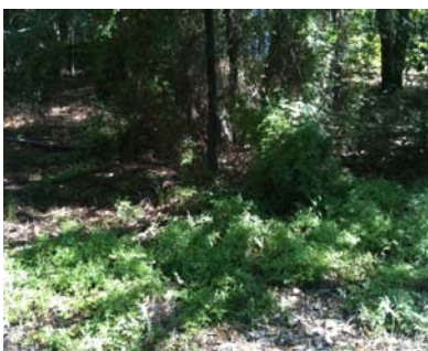
L. japonicum in 80 acres of planted pine