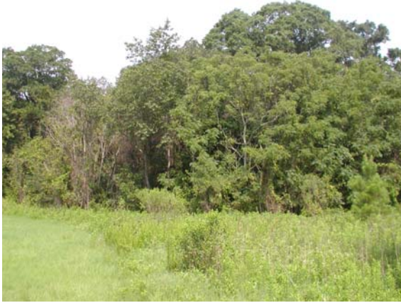
Melia azederach (Chinaberry) surrounding a 35 acre hay field before treatment