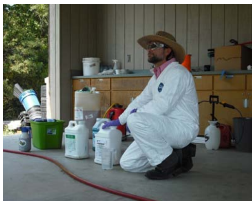
Herbicide training for the public

Save the Date: ARSA Spring 2012 meeting is currently scheduled for April 5th at the St. Joe Buffer Preserve... watch for email updates in the coming weeks.