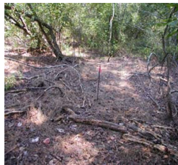
Point 2 of 5; 45 days after treatment

Japanese Stiltgrass is an invasive annual grass that has spread throughout the eastern seaboard and west to the Mississippi Valley. This infestation at ABRP is the first officially documented site in Florida. ARSA CISMA has treated the area two years in a row and we plan to make it a special focus for Early Detection/Rapid Response in FY2012.