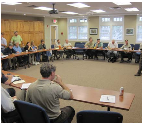
Fall 2011 ARSA Meeting, St. Marks National Wildlife Refuge