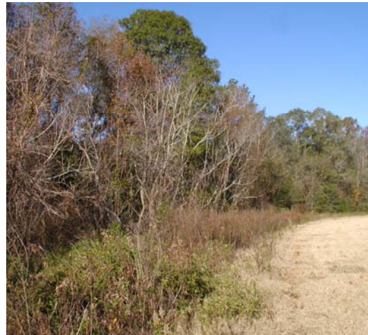
60 days after treatment; the 8 acre woodland surrounding hay fields surveyed and treated.

This is the second year ARSA CISMA has treated invasives on this private site near Three-Rivers State Park in Jackson CO. The property owner is a Master Gardner and has taken a special interest in keeping her woodlands dominated by native hardwoods. We hired a private contractor to survey and treat the 8 acre woodland surrounding a 35 acre hay field. Invasive species treated include: Lygodium japonicum (Japanese Climbing Fern), Nandina domestica (Heavenly Bamboo), Ligustrum sinense (Chinese privet) and Sapium sebiferum (Chinese Tallowtree.)