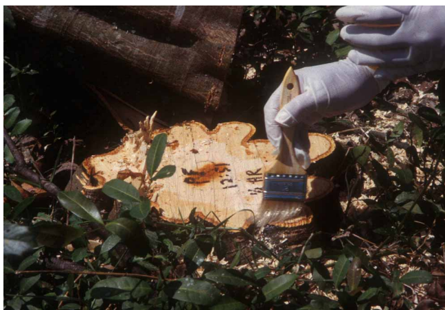
Figure 1. Cut stumps close to the ground and as level as possible. Concentrate the herbicide just inside the bark.

Anyone who performs pest control on Florida lawns and ornamentals as a business, or anyone who applies pesticides to their own business property or