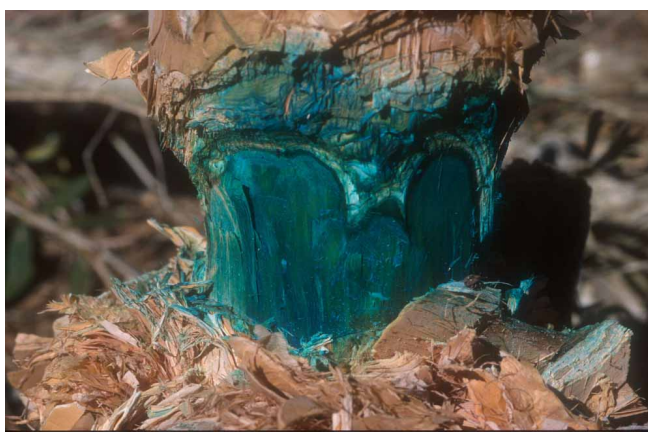
Figure 3. For species with thick bark (such as melaleuca), herbicide must be applied after girdling the tree.

employees who apply pesticides to their employer's business property, or any government employee who applies pesticides to lawns and ornamental plants of formal plantings adjacent to public buildings, must be licensed according to provisions in Chapter 482 of the Florida Statutes. Additional information on